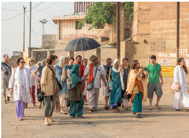
Walk along the Ganga in Varanasi, India, 2016