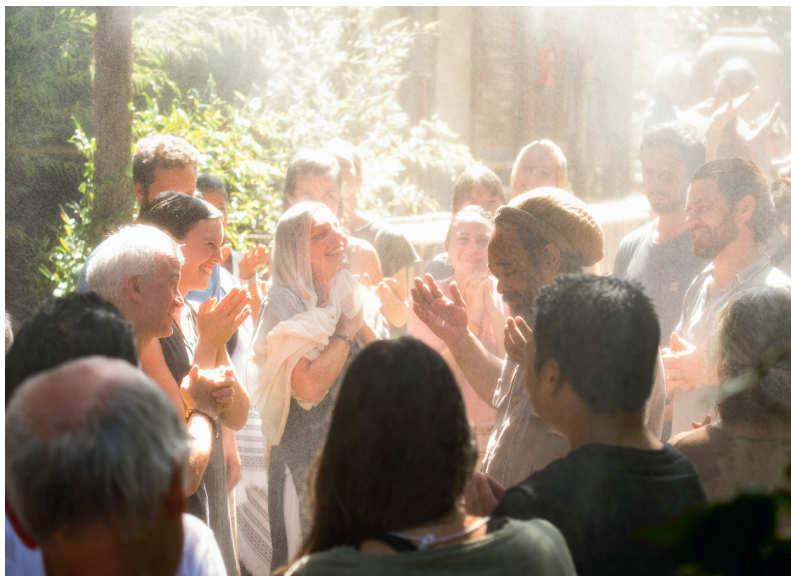
'Shower of Grace', Monte Sahaja heatwave, 2019