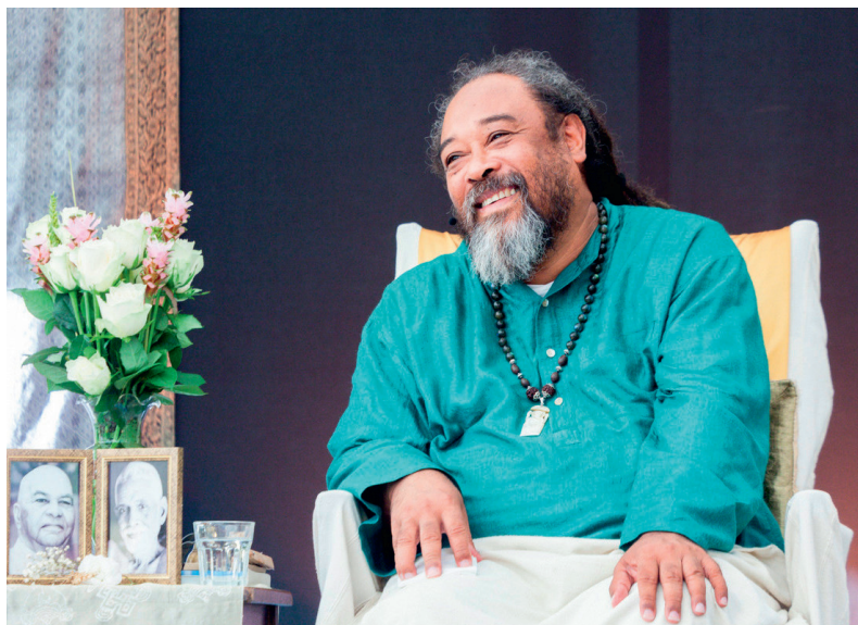
Satsang in Titignano, Italy, 2016